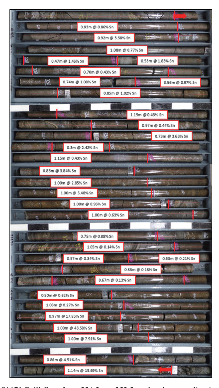
Figure 3: S1671 Drill Core from 224.2m – 252.2m, showing sampling intervals and tin assay results.